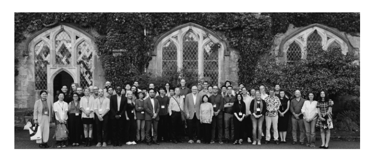
ENOJP Konferenz in Cork, Irland.